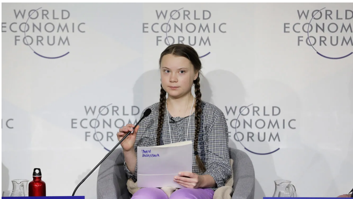
Greta Thunberg, 16, speaks at World Economic Forum in Davos.