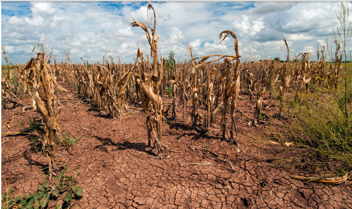
Corn shows the affect of drought in Texas in August 2013.