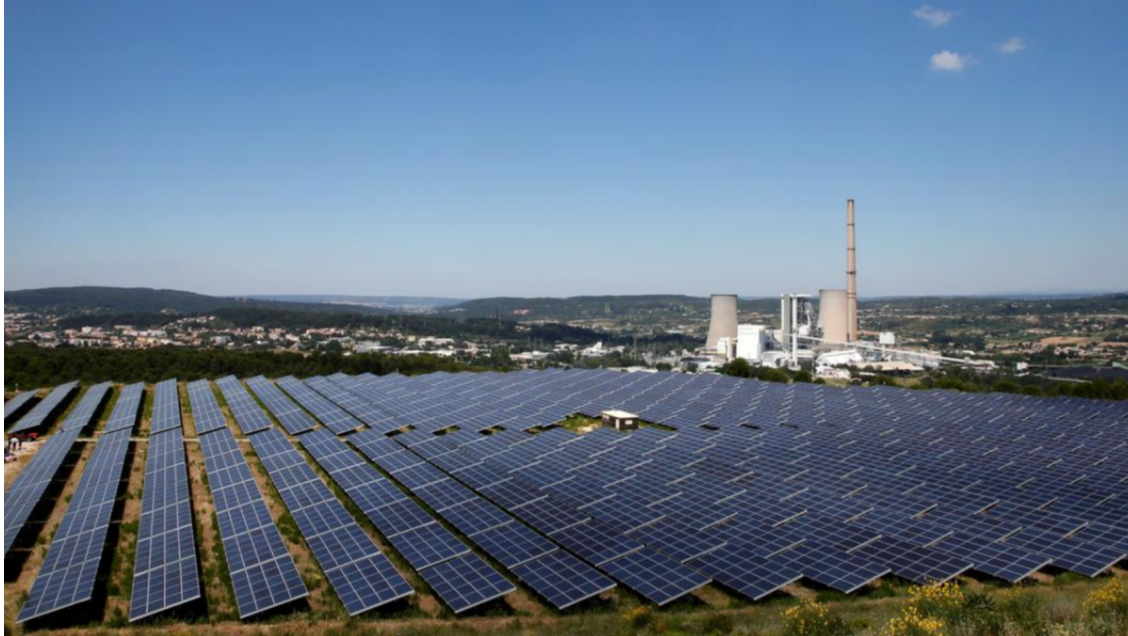
A general view shows solar panels to produce renewable energy at the Urbasolar photovoltaic park in Gardanne, France, June 25, 2018.