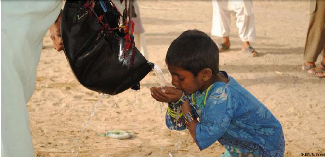
Drought in Pakistan.