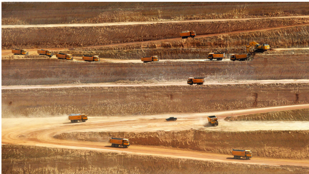
Trucks hauling coal at a Chinese-financed open-pit mine in Pakistan's Sindh province in May 2018.

The ambitious Belt and Road Initiative, launched by China's President Xi in 2013, aims to transform economies from Eastern Mediterranean to China and beyond through infrastructure and other investments. But by relying on coal-fired power plants, the Initiative may make reaching Paris-agreed greenhouse gas mitigation goals impossible. – The Atlantic