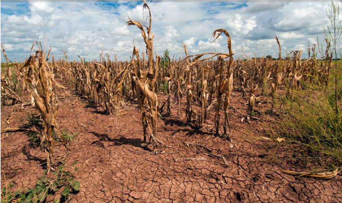
Corn shows the affect of drought in Texas in August 2013.