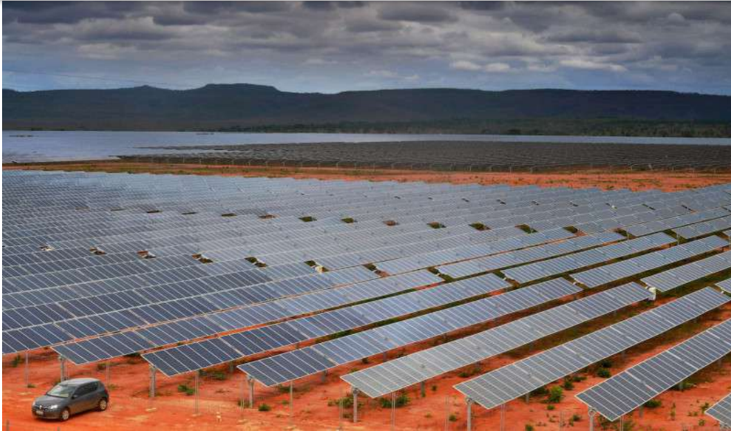
A view of an 800-hectare solar farm in Pirapora, Minas Gerais state, Brazil, on Nov. 9, 2017.