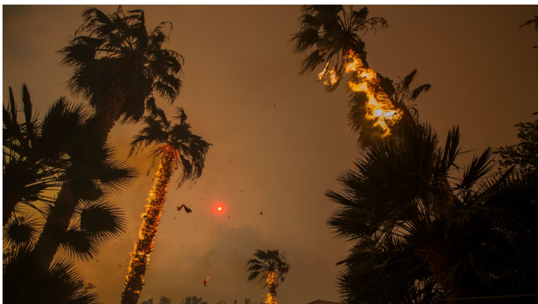
Wildfire, Malibu, California, on November 9.

California utility Pacific Gas and Electric (PG&E), one of the largest in the US, filed for bankruptcy after facing $30 billion in damages and 650 lawsuits following disastrous wildfires. PG&E's situation could mark a milestone: the first major corporate casualty of climate change and an indication of future market risks. – Vice