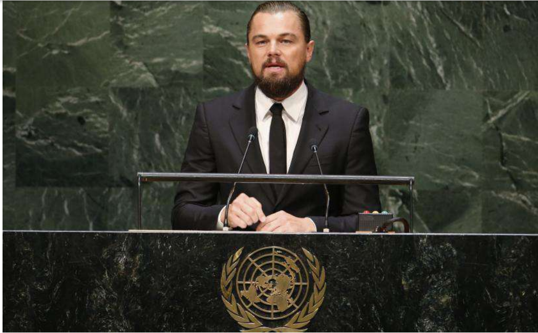
Actor Leonardo DiCaprio, a UN Messenger of Peace, speaks at the opening session of the United Nations climate summit in New York on Sept. 23.