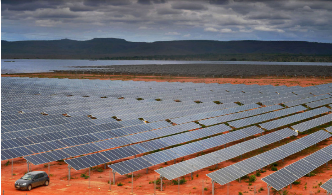
A view of an 800-hectare solar farm in Pirapora, Minas Gerais state, Brazil, on Nov. 9, 2017.