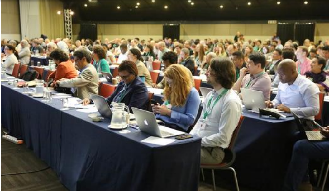
Delegates attending the Intergovernmental Panel on Climate Change (IPCC) held at the Durban ICC, January 2019.