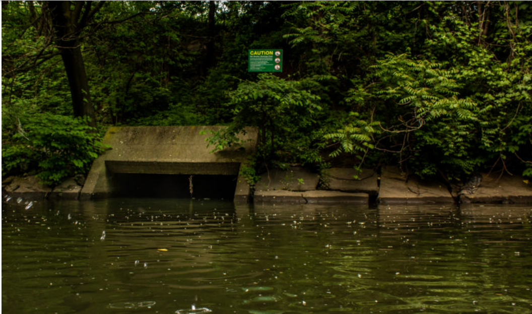
A CSO/Wet Weather Discharge Point on the West coast of the Bronx River near Tremont Avenue, New York.