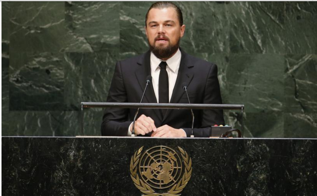
Actor Leonardo DiCaprio, a UN Messenger of Peace, speaks at the opening session of the United Nations climate summit in New York on Sept. 23.