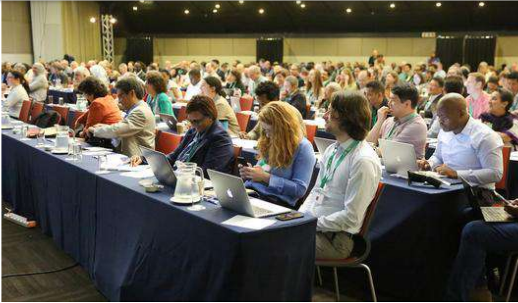
Delegates attending the Intergovernmental Panel on Climate Change (IPCC) held at the Durban ICC, January 2019.