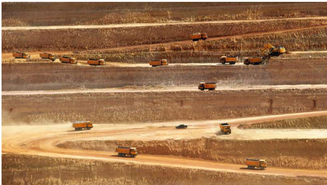
Trucks hauling coal at a Chinese-financed open-pit mine in Pakistan's Sindh province in May 2018.

The ambitious Belt and Road Initiative, launched by China's President Xi in 2013, aims to transform economies from Eastern Mediterranean to China and beyond through infrastructure and other investments. But by relying on coal-fired power plants, the Initiative may make reaching Paris-agreed greenhouse gas mitigation goals impossible. – The Atlantic