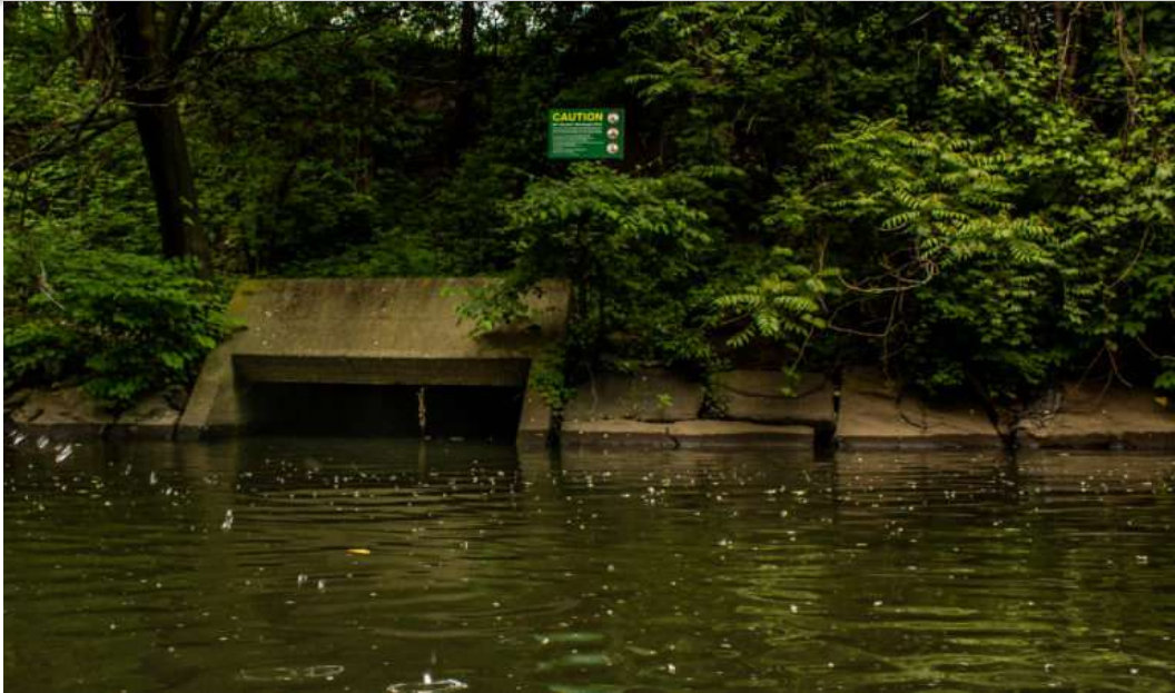
A CSO/Wet Weather Discharge Point on the West coast of the Bronx River near Tremont Avenue, New York.