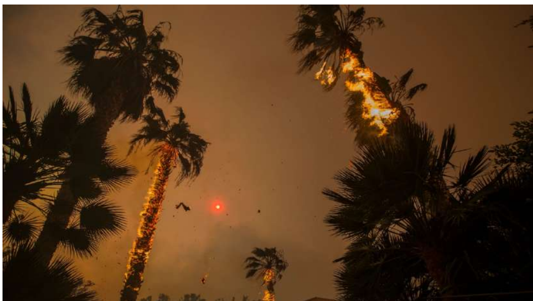
Wildfire, Malibu, California, on November 9.

California utility Pacific Gas and Electric (PG&E), one of the largest in the US, filed for bankruptcy after facing $30 billion in damages and 650 lawsuits following disastrous wildfires. PG&E's situation could mark a milestone: the first major corporate casualty of climate change and an indication of future market risks. – Vice