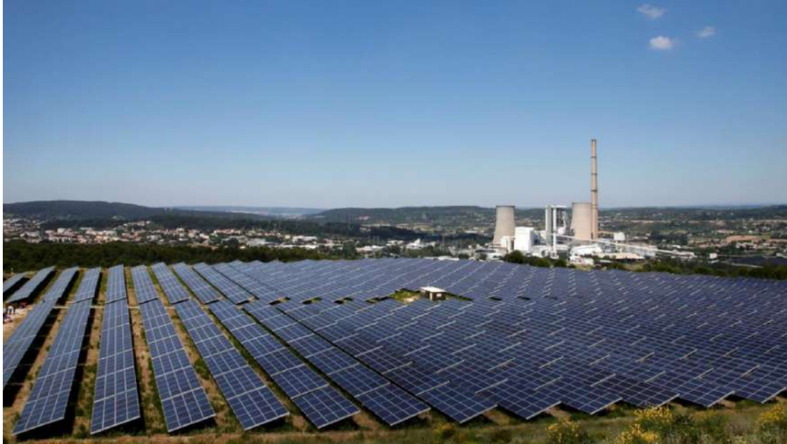
A general view shows solar panels to produce renewable energy at the Urbasolar photovoltaic park in Gardanne, France, June 25, 2018.