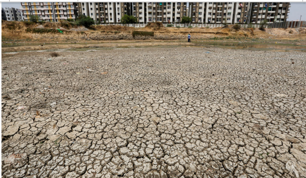
Residential apartments are seen next to the dried-up Ratanpura lake on the outskirts of Ahmedabad, India May 9, 2016. India is currently facing its worst droughts in decades.