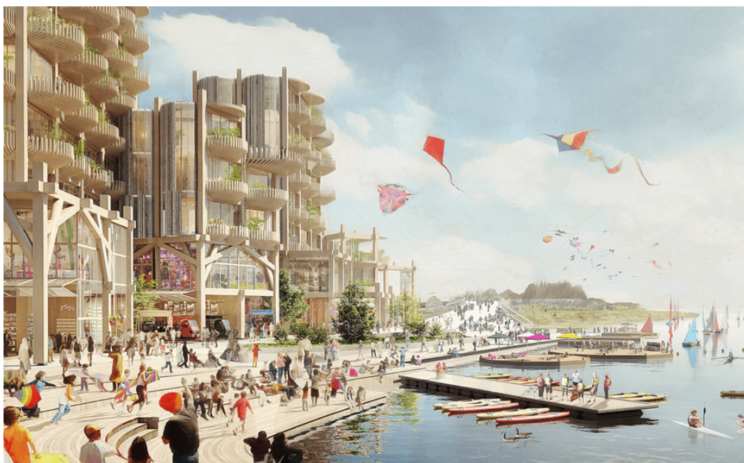
High hopes: Sidewalk Labs' master plan for the Toronto waterfront is finally here.