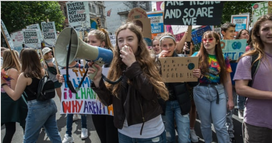
Striking school students marching along Whitehall from Parliament Square in June.