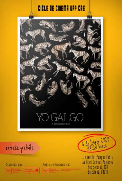
UPF-CAE Film Series