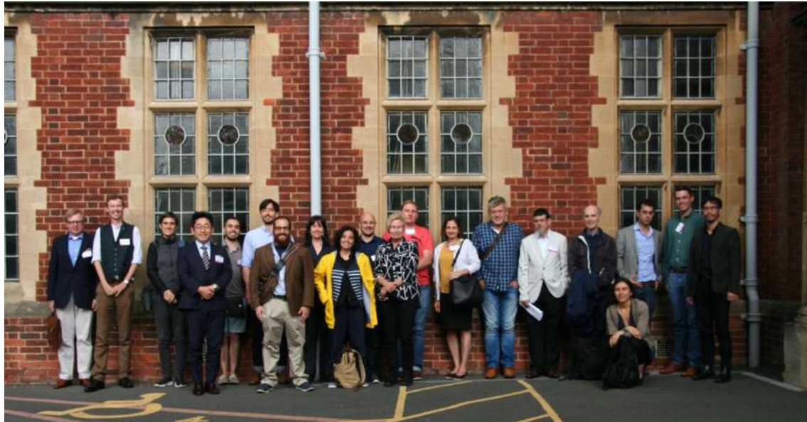
Celebrating the success of the Barcelona's Zoo Campaign