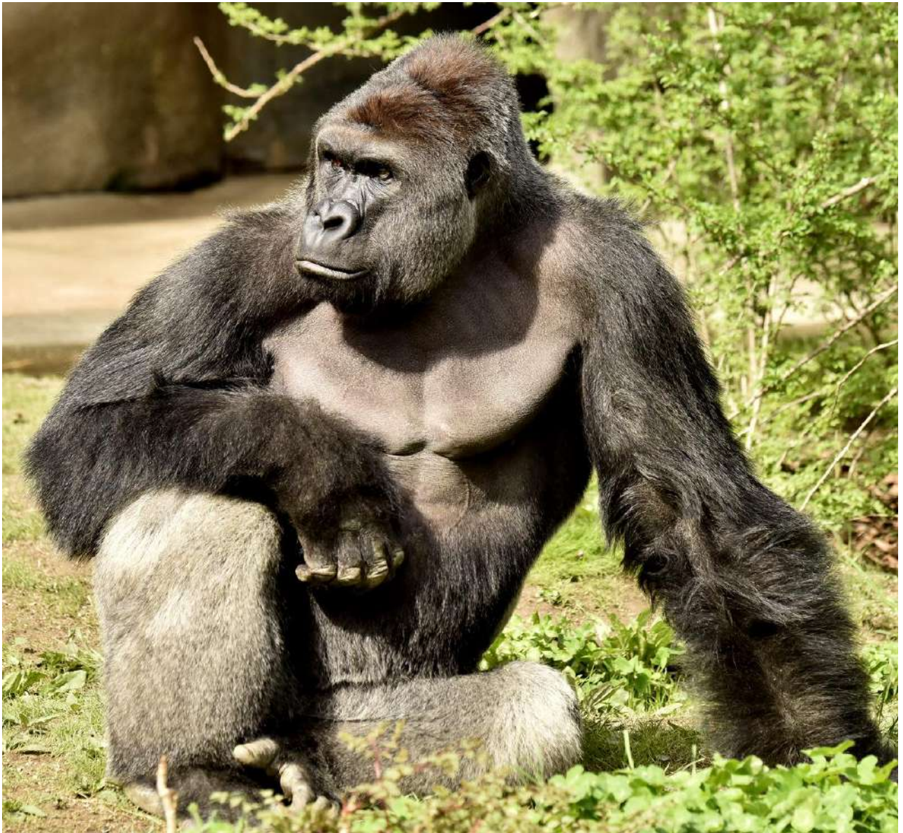
Harambe