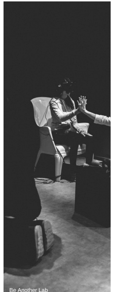
Be Another Lab

If I were you, would I better understand myself?