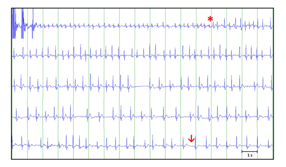
Fig. 2. Sample of post-ictal atrial fibrillation evolution. Post-ictal sinus tachycardia (first line), beginning of atrial fibrillation (asterisk), and posterior conversion into atrial flutter (third line). Return to sinus rhythm in the last line (arrow).